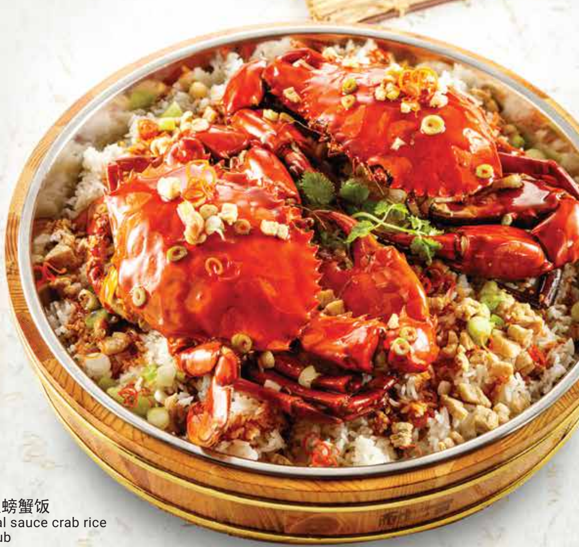
一桶豉油皇螃蟹饭 chef's special sauce crab rice in bamboo tub