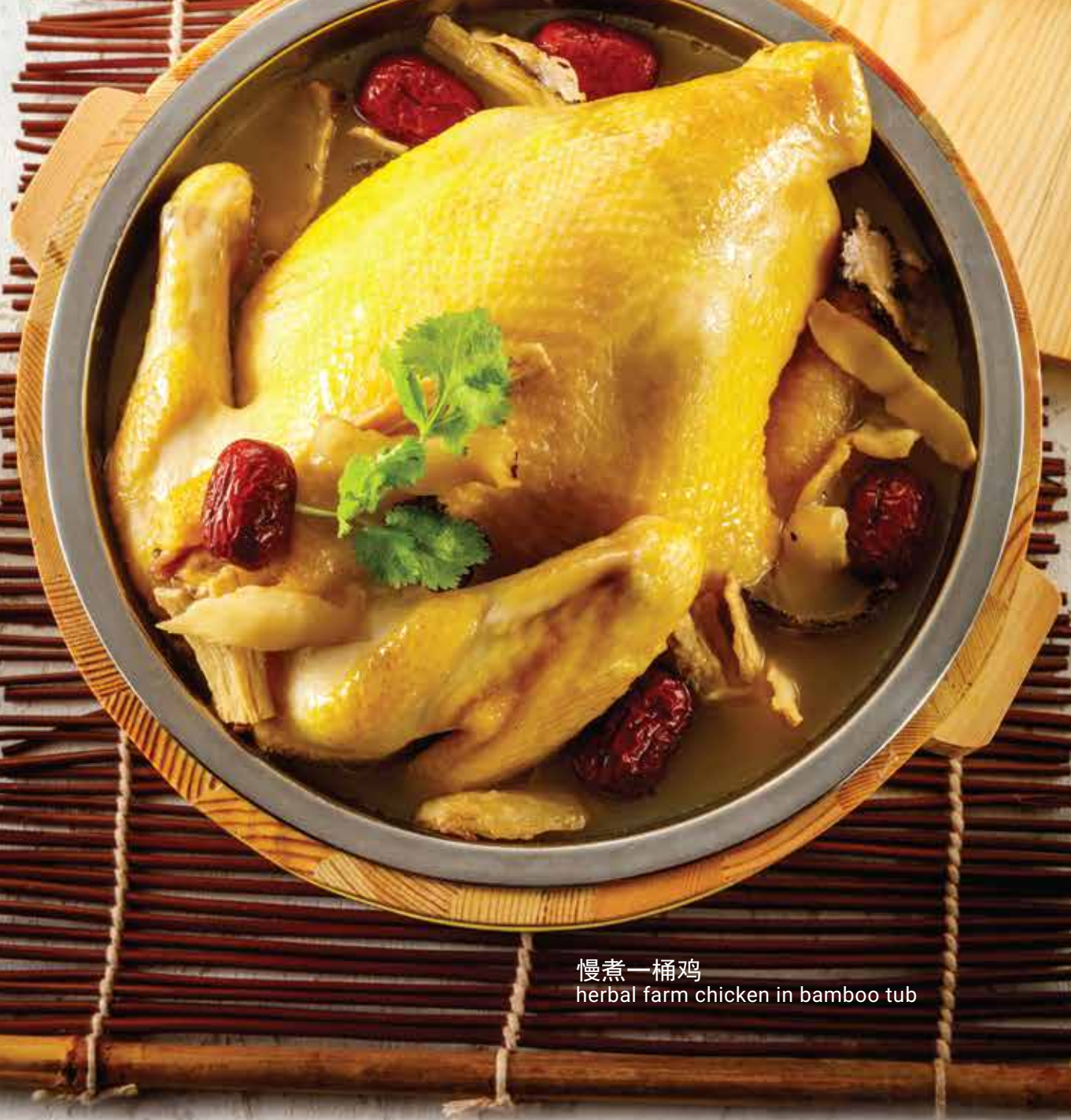
慢煮一桶鸡 herbal farm chicken in bamboo tub