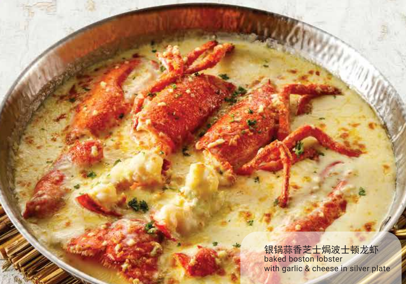
银锅蒜香芝士焗波士顿龙虾 baked boston lobster with garlic & cheese in silver plate