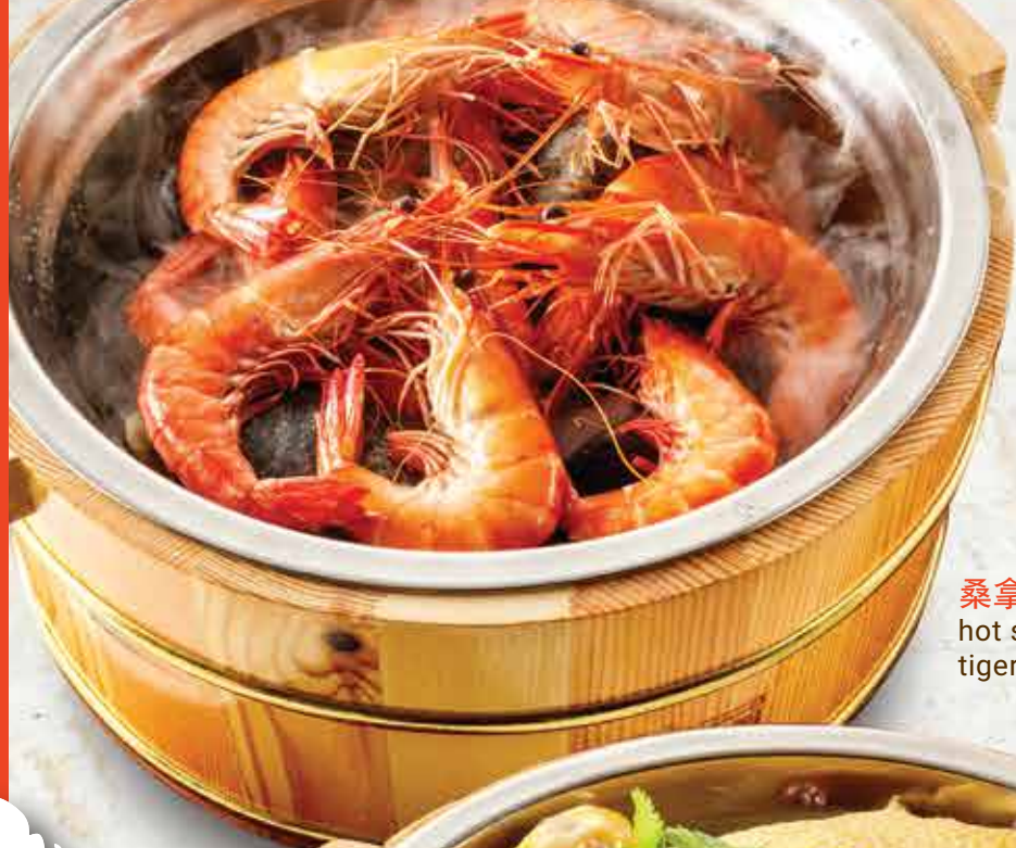
桑拿草虾 hot stone sauna tiger prawn