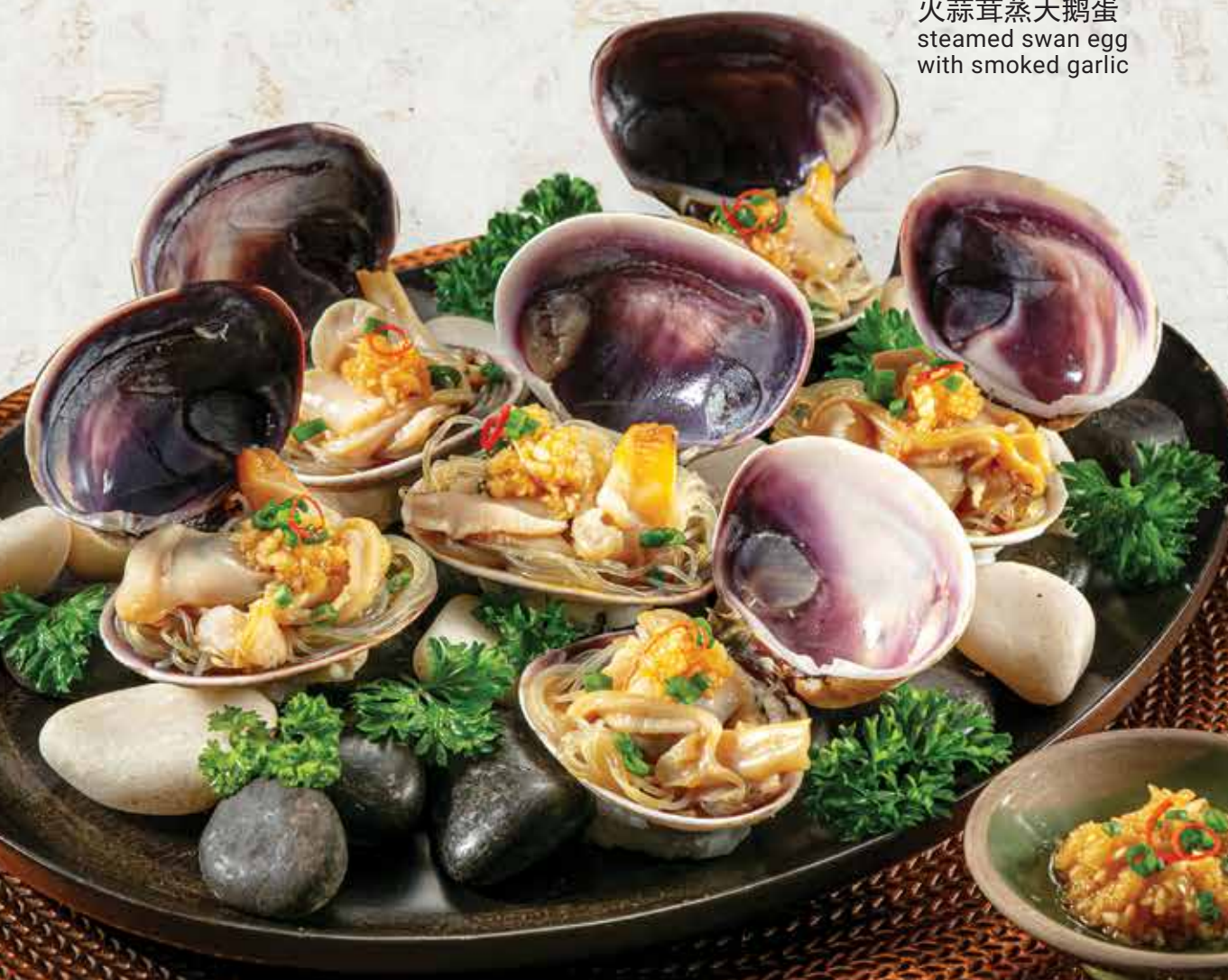
火蒜茸蒸天鹅蛋 steamed swan egg with smoked garlic