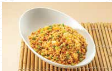
潮酱一品炒饭 fried rice with teochew spicy sauce RM38 每份/ per portion