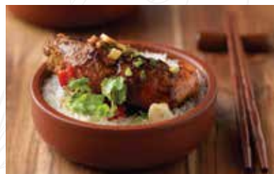
豉油皇原只生虾砵仔饭 steamed rice with whole fresh water prawn RM38 每位/ per pax