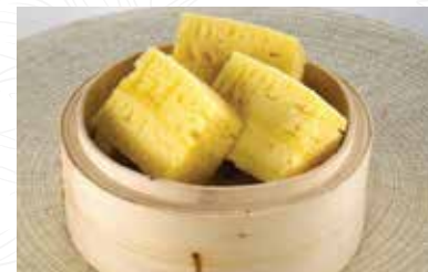
千层马来糕 thousand layered cake RM12 3件/ 3 pieces