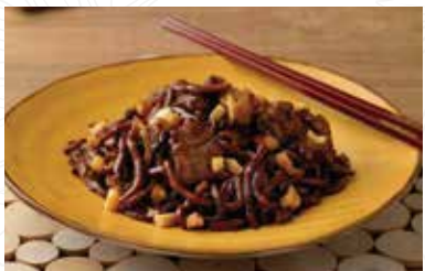
金牌福建面 fried noodles hokkien style RM33 每份/ per portion