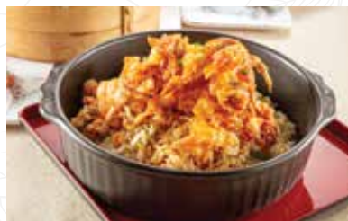
十万火急软壳蟹蒜香饭 crispy soft shell crab & garlic fried rice RM58 每份/ per portion