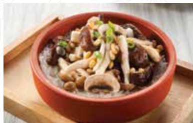
三菇松子砵仔饭 steamed rice with mushrooms & pine nut RM17 每位/ per pax