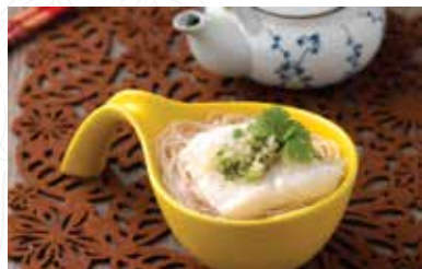
姜茸鱼片过桥米 rice noodles with fish fillet & minced ginger RM22 每位/ per pax