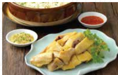
客家走地鸡伴盐香姜茸饭 steamed chicken with salt & ginger rice RM108 半只/ half RM198 每只/ each