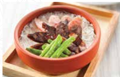
客家腊味砵仔饭 steamed rice with waxed meat hakka style RM17 每位/ per pax