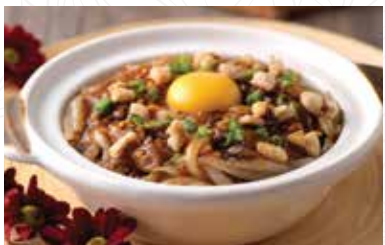
瓦煲老鼠粉 claypot 'loh shu fun' RM33 每份/ per portion