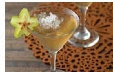
万星甫冻 lemongrass jelly RM11 每位/ per pax