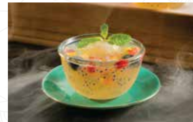
缤纷香茅燕窝冻 bird's nest lemongrass infusion with basil seeds & mixed fruits RM23 每位/ per pax