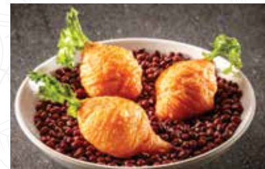
花心萝卜仔 peanut lava carrot RM18 3件/ 3 pieces