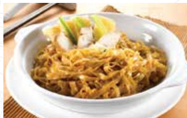
乡下佬面卜 egg noodles village style RM38 每份/ per portion